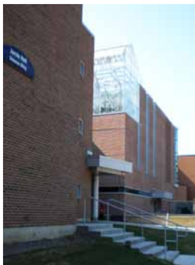
STEM Conference held at Jarvis Hall