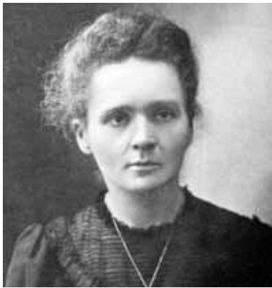
An Early Innovator—Madame Marie Curie (See pg. 19 for more details)